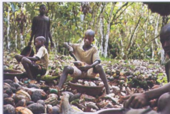
~ Children working in a cocoa farm ~

Most of the children who works at the Cacao farm These children are wanting works are poor and works for their your help to get out from parents. Almost all of these this situation. You can help child workers age range are these children by from early teens to younger participating in activities kids like 3 year old. Their such as the 'Cocoa