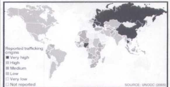
World Map showing countries of origin for human trafficking

Human Trafficking is more often and now, it is a global problem. Like in a past, Often, people are people sell slaves each tricked by trafficker and other and get money. being sold to others. $90 is known to the UN estimates that average cost of human about 2.5 million people slave around the world. are forced to become a It is not legal in any- slaver as a result of where but happening trafficking.