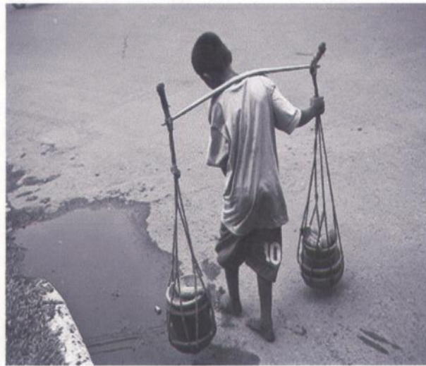
Child slave who is forced to carry water everyday

Does the slavery exist in modern time? In the past, slaves were traded in the open markets, but now, many people are tricked and forced to work as a slave. Now days, slave trading is a part of a criminal in every countries and also prohibited by the 1948 Universal Declaration of Human Rights or the 1956 UN Supplementary Convention on the Abolition of Slavery, the Slave Trade and